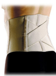
Double Pull Lumber Support $44.00