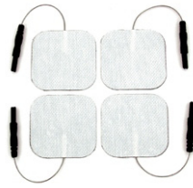
Adhesive Disposable Electrodes Model ELTD-4 $6.85