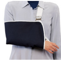
Arm Sling $22.00