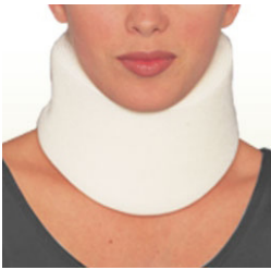
Cervical Collar $15.00