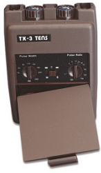
Analog Tens Unit Model TX-3T $45.00