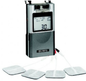
Digital Tens Unit Model ST-661T $55.00