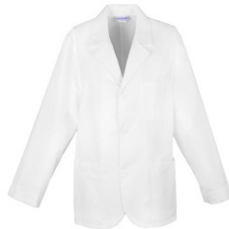
Consultation Coat All Sizes Model LC-2 $35.00