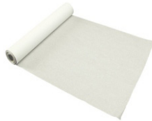
Exam Table Smooth Paper Roll 18" x 225', 12 rolls $31.99