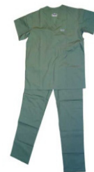
Scrub Sets All Sizes Model LC-3 $35.00

To order please call (416) 817-4114 or Fax (905) 597-4114 and visit our website www.wellnessmedicalsupplies.com for a wide range of Home Health Care Products