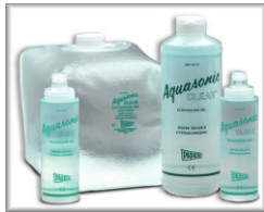
Clear ultrasound Gel 5 Litre Bottle $10.00