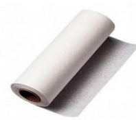
Headrest Paper Roll 8.5" x 225', 24 rolls $49.85