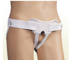
Hernia Belt $40.00