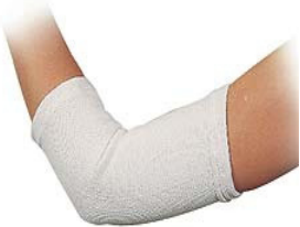
Elbow Support $18.00