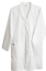
Lab Coats All Sizes Model LC-1 $35.00