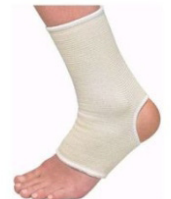
Ankle Support $18.00